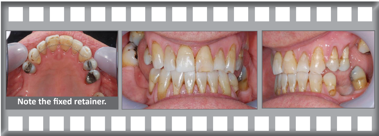
Note the fixed retainer.