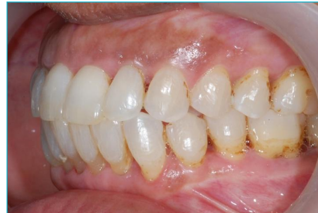
8 months treatment