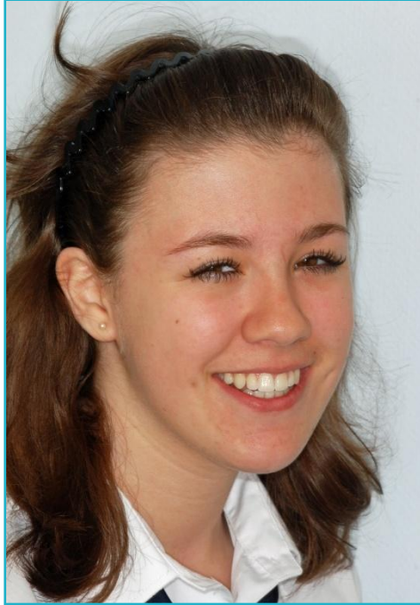
Finished Result after 19 months