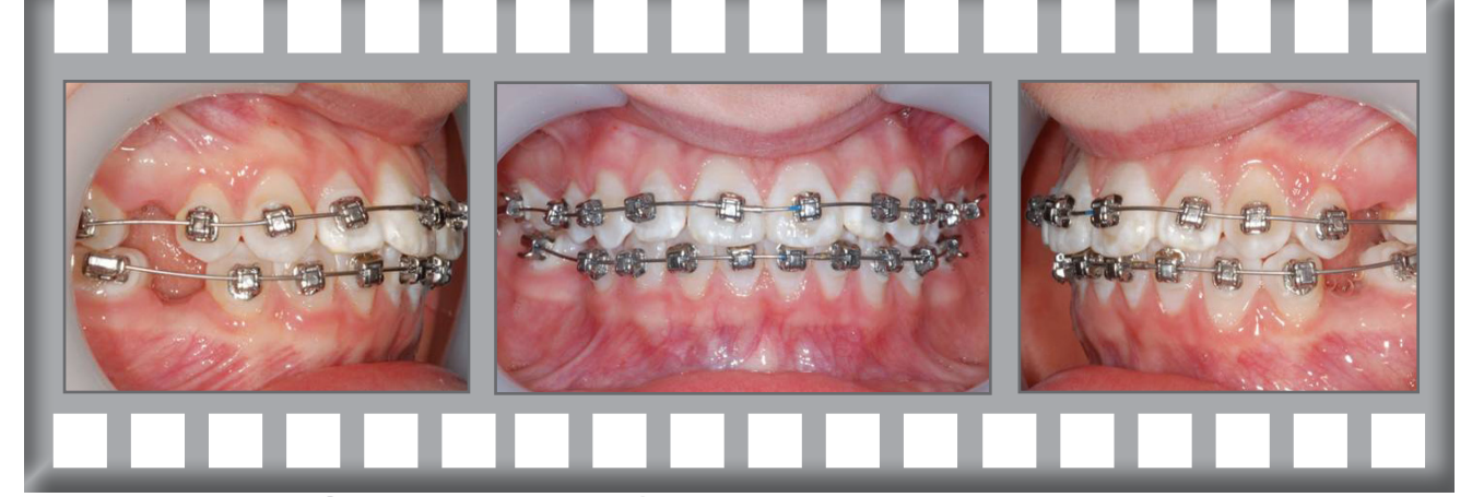
Progress after 5 months.