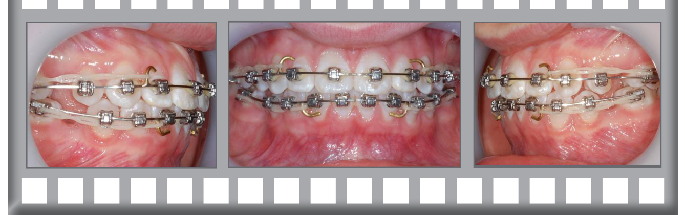
Progress after 11 months.