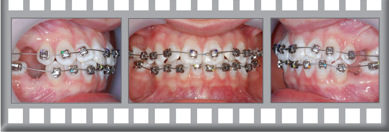
Progress after 2 months.