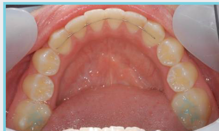
Note Fixed Retainer