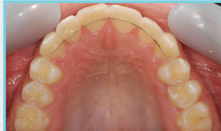
Note Fixed Retainer