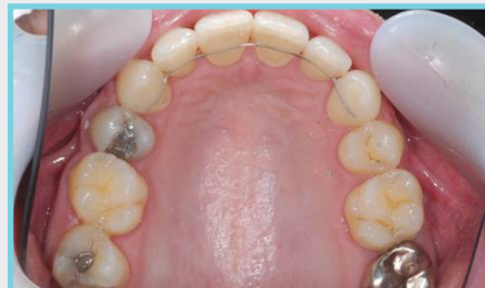
Note Fixed Retainer