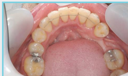
Note Fixed Retainer