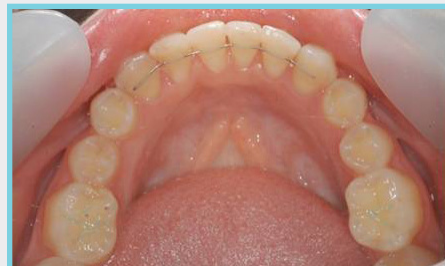
Note Fixed Retainer