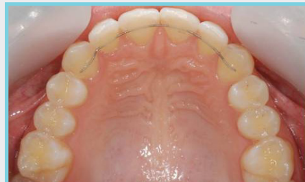
Note Fixed Retainer