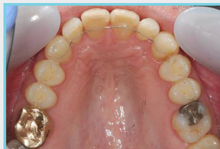
Note fixed retainers